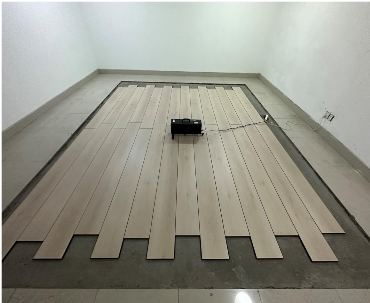
Test set up